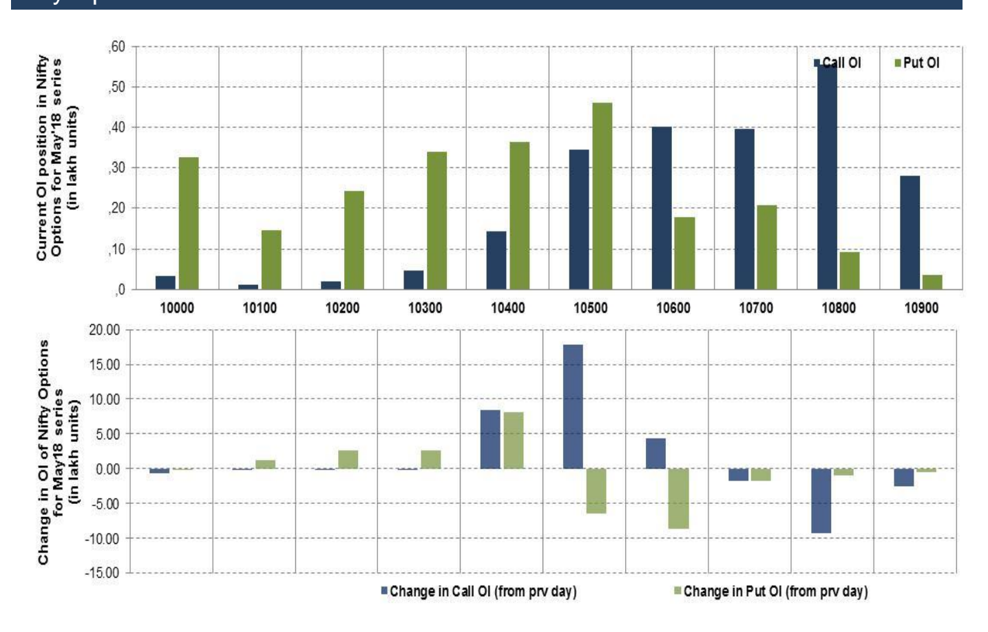
Note – Change in OI of Nifty Options refers to change from previous trading day Source-NSE, SIHL Derivatives Research (Institutional Equities)